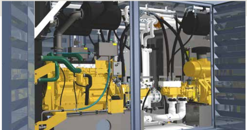
Detailed engineering performed using Solid Edge.