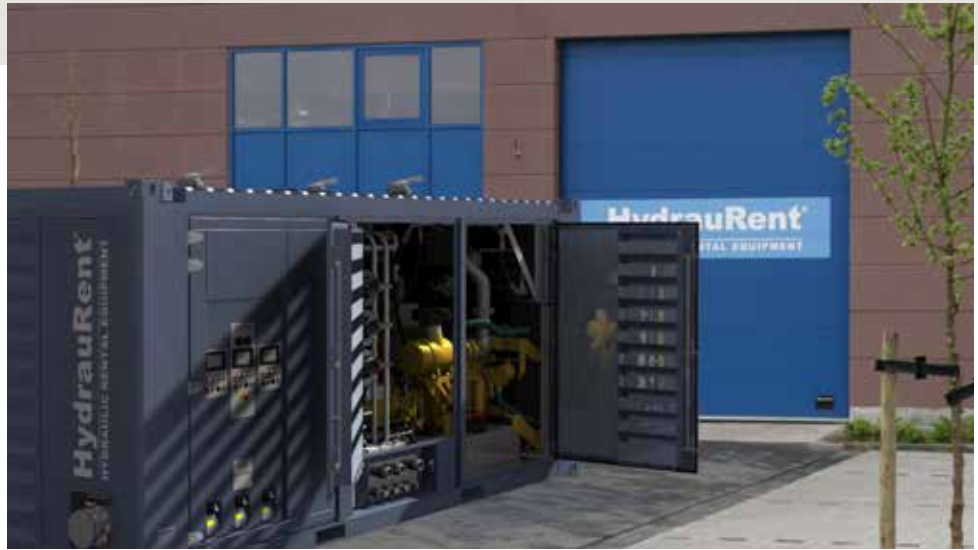
Hydraulic power unit designed with Solid Edge.

Alex van’t Westeinde Mechanical Design Engineer Hydrauision